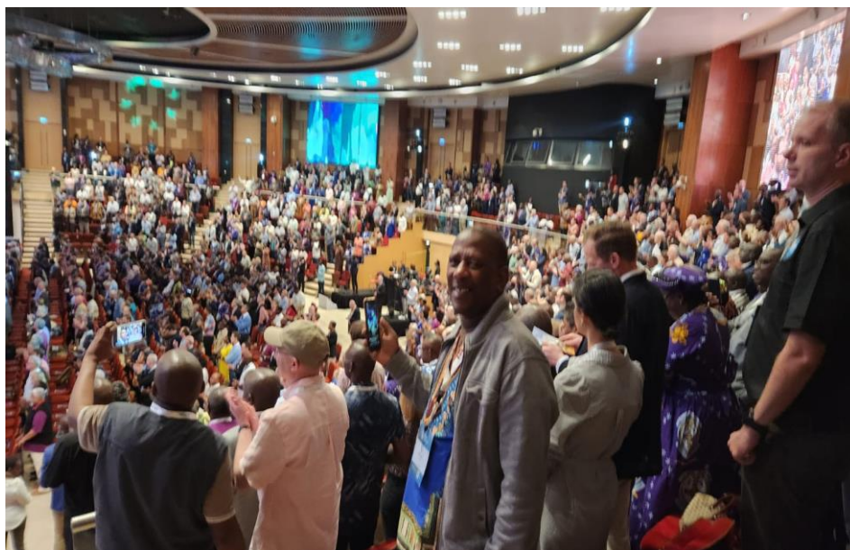
GAFCON, Kigali, Rwanda

This year, I had the pleasure of joining my colleagues from REACH SA in representing the organization at the GAFCON conference in Kigali, Rwanda. Over 1,500 Anglicans, both clergy and laity, gathered in Kigali for this event.