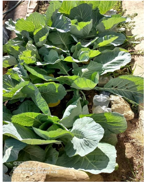
Community Garden Project