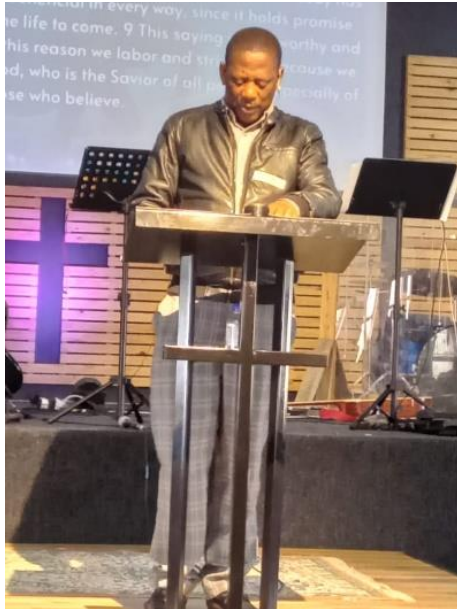
REACH SA Men's Convention