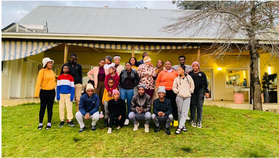
Young Adults Camp