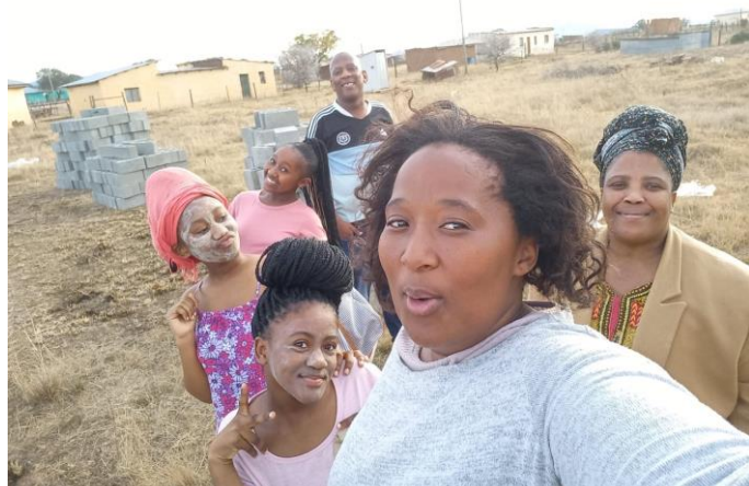
Friends in KZN